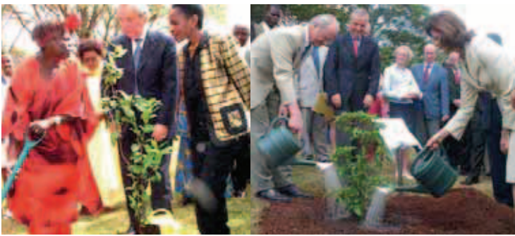
Wangari Maathai, Nobel Peace Prize winner, and Klaus Töpfer, former director of the Environment Programme of the United Nations (UNEP). King Carl Gustav of Sweden and Silvia of Sweden planting for the planet.